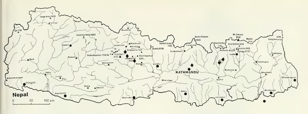
Fig. 2. Collection sites of Bufo microtympanum material from Nepal in the Zoologische Staatssammlung München. ♦: site.

the tarsometatarsal articulation of the hindlimb reaches between the eye and the tip of snout. The large warty tubercles on the back tend to form two parallel rows on each side of the median line; the smaller warts on the upper surface are irregular, distinctly porous, black and spiny. Parotoids prominent, kidney-shaped or elliptic, shorter than head, twice and a half longer than broad. Coloration brown above and yellow beneath, marbled with brown. The measurements from the largest male and female specimens are given in Tab. 1.